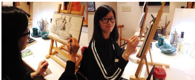
Learning from real still-life's